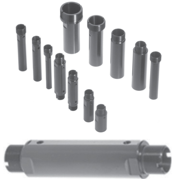
STRAIGHT SHANKS FOR QUICK CHANGE ER COLLET SYSTEM (COLLET NUT NOT INCLUDED)