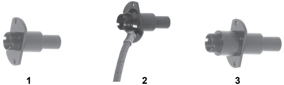
SHOWN WITH OPTIONAL COOLANT LINE (SEE PAGE 121)