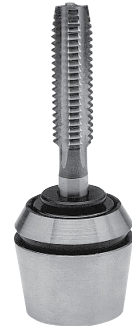
ER Quick-Change Tapping Collets with Axial Compensation

For use with any ER collet chuck, these tapping collets help prevent tap breakage on machines requiring axial compensation. Friction-free ball-bearing drive. Metric sizes available upon request.