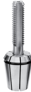
ER Rigid Tapping Collets with Square Drive

For synchronous tapping operations using any ER collet chuck. Collet bore is exact tool diameter, with square drive, for accuracy and rigidity. Available sealed for coolant-through applications, as well as in DIN and JIS standard metric sizes.