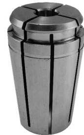
Single Angle Collet Extractor 100TGCE