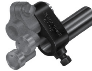
With Roller Backrest*

When used in conjunction with standard Somma R & L turning tool attachments as shown below.