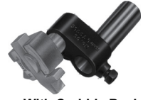
With Carbide Backrest*